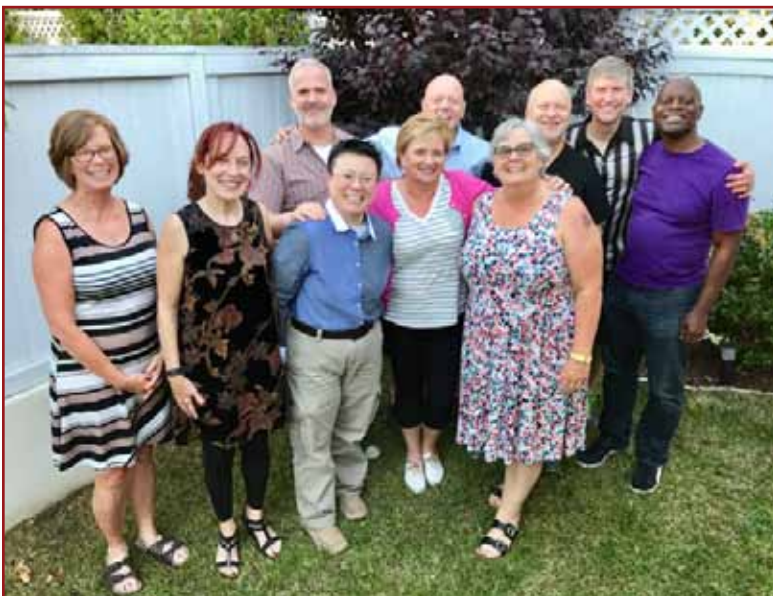
The "Free Range Baconators" Comma Group shares a moment.