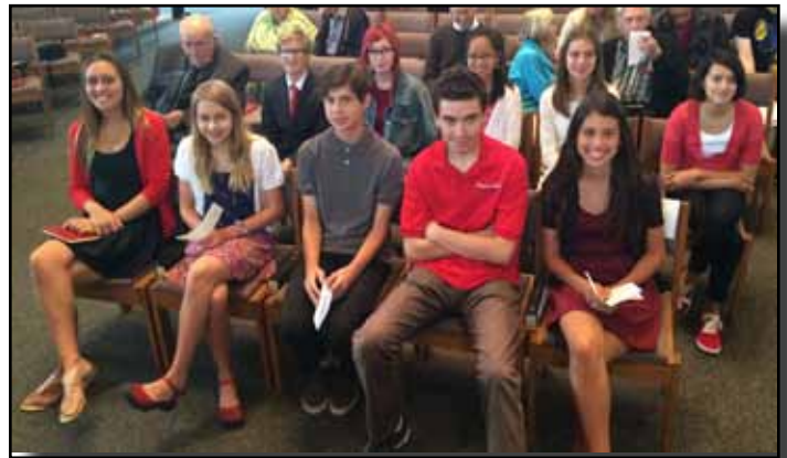
Confirmation Class of 2015