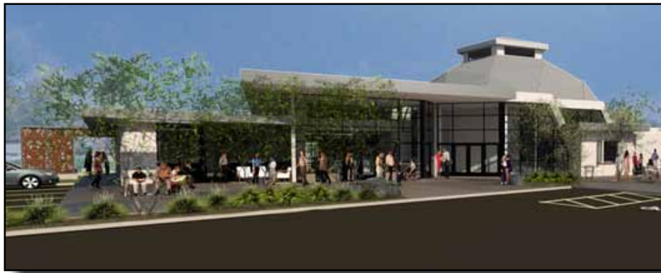
This rendering illustrates current Phase 1a planning.

Be sure to attend the Winter Congregational Meeting to hear an update on the building plans. In the meantime, please contact btfchair@iucc.org or any task force member with your questions.