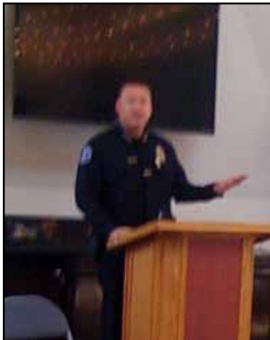
The Police Chiefs of Newport Beach, Irvine, and Costa Mesa talked with the visitors about their jobs & departments.

All three police departments have chaplains & rabbis to assist people in need.