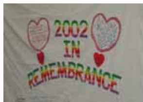
We were privileged to include a display of AIDS quilt replica panels as part of the conference.