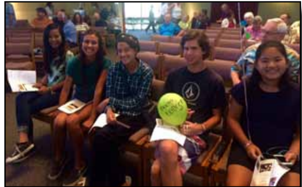
Five of our youth led the opening prayer