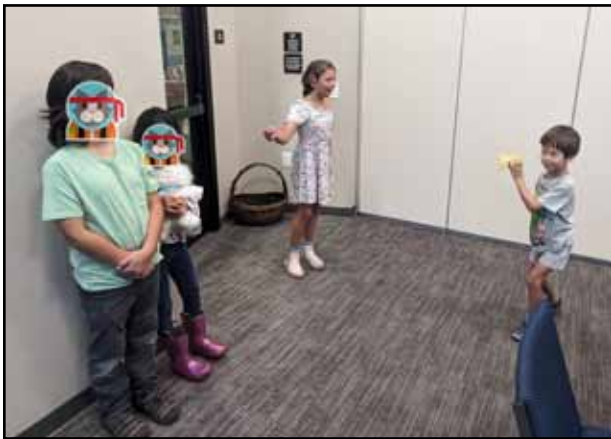
Sneaky statues & the night guard as we learn about the “when and why” of rules and when to speak up about rules for Tangled .