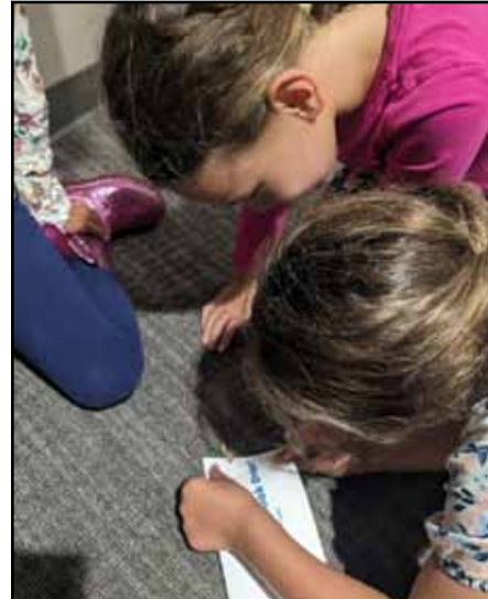
We helped take a lost caterpillar outside!