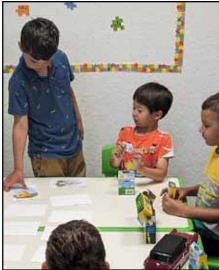
A matching game as we imagine about Winnie the Pooh and his friends!

We used circle time conversation, role play, and games to connect lessons from Winnie the Pooh , Moana , Tangled , and Encanto to explore stories about God and love!